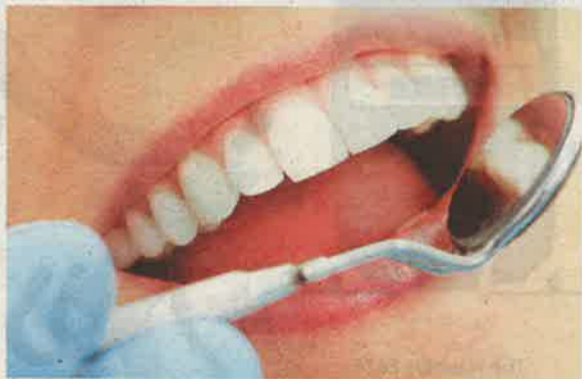
Tooth decay due to bacterial infection is common in Malaysia and can lead to loss of part of the tooth. Right: Prevalence of tooth decay represented in age groups.